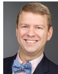
SAMUEL FRENCH Rodefer Moss & Co