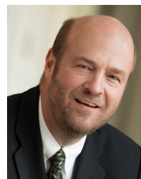
DICK SPENCE HBK CPAs & Consultants